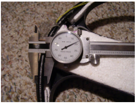
Fig. 2 Measuring the diameter of final shielded coil bundle.

When the spiral wrap is added to the wire bundle, the bundle diameter will increase about 1/16" more. If you want to make a coil with minimal coil-toshield capacitance, use two layers of spiral wrap, one 1/8" OD diameter and the other 0.250" OD. Subtract 1.5 times the total wire bundle diameter including all layers of spiral wrap plus shield added to the coil from the maximum coil housing diameter to obtain the actual winding ID of your coil form. The reason I use 1.5 and not 2 is that there are two thicknesses of the spiral wrap on each side, making up a total of 4 thicknesses. The two layers on the inside of the coil and do not increase the OD fit of the coil. The final coil bundle crosssection diameter with the Scotch 24 shield and final tape wrap is .315" and just fits the 11" Hayes Electronics coil housing with little room to spare.