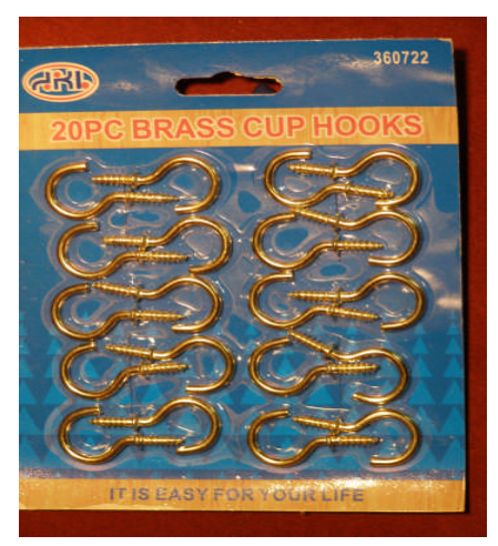
Fig. 3 Cup hooks used for my coil.

shafts parallel. Accurately space and measure the inside distance between the