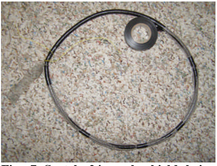
Fig. 7 Scotch 24 mesh shield being secured to coil with tape over second layer of spiral wrap.

There are two ways to add the shield depending on the size and shape of the shield material used. If you use two layers of spiral wrap, the final wire bundle diameter will be .25" with a circumference of 0.785". This allows you to use a .75" wide 3M 1190 shielding tape applied around the circumference and bent over to almost totally enclose the total coil with a 0.035" gap.