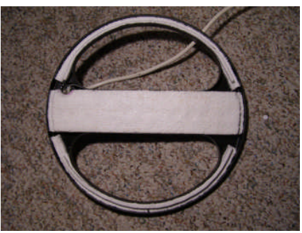
Fig. 10 Styrofoam strips ready for coil insertion

without the coaxial cable, but fully assembled with both halves and internal foam weighs 8.3 ounces (0.236kg) and with 33" of coax and connector weighs 10.6 ounces (0.300kg).