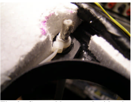
Fig. 9 Coax cable secured with wire tie. Epoxy tail of wire tie to coil housing wall.

If you make the coil for use on the beach or for use in the water, the coil needs to be sealed up to be waterproof. Once the coil is made, installed inside the coil housing, tested and sealed up, it is important that the coil be secure inside the coil housing. Any movement of the coil relative to the shield or movement of the coax cable could cause a false signal. A sealed up coil is very difficult to open without damaging the housing so make it right before sealing it up.