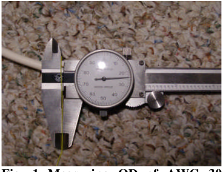
Fig. 1 Measuring OD of AWG 30 Teflon wire.

I am going to use AWG 30 single strand Teflon wire that is 0.024"OD (+/- .002"). I obtained my Teflon wire from eBay (search on the words "Teflon wire"). If you are using different wire, just substitute your measured wire OD and follow along with the design process. You need to accurately measure the OD of your wire with a gauge. For a 300 to 350uH coil with 18 to 20 turns, multiply the wire OD by 5 to closely approximate the OD of the wire bundle. This wire bundle will be 0.12" or about 1/8". When calculating your coil size and inductance, go to the following on-line inductance calculator. coil http://mv.athenet.net/~multiplx/cgibin/airind.main.cgi.