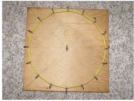
Fig. 4 Cup hooks mounted to make coil form.

Before winding your coil, you should check the accurate ID of your "C" hook coil form by wrapping one loop of wire around all the hooks. Pull the wire tight as it goes over one hook and then place a mark on the wires. Measure the distance between the marks on this piece of wire and divide this length by 3.14159 and you will confirm the actual diameter of your coil. Adjust if necessary.