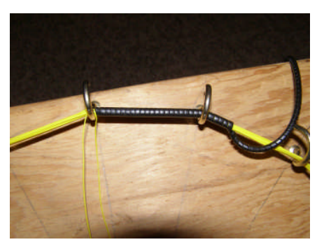
Fig. 5 Close-up of spiral wrap. See how spiral wrap can be easily slipped under each hook.

With the coil wire still on the "C" hooks, you can apply the spiral wrap without the need to lace it. This is the main reason to use the "C" hook coil form. If vou measure the inductance of the coil on the "C" hooks, 19 turns of AWG 30 on a 10.5" ID gives you about 285uH. Once the spiral wrap is added, the wire bundle is held tighter and the inductance is about 317uH. Since the ID of the spiral wrap is 1/16" it will expand to accommodate the 0.12" 19-turn wire bundle (.024" X 5= .12"). Cut the 1/8" OD spiral wrap 1.65 times the coil circumference (not stretched) to accommodate this expansion with a few inches to spare. Starting at the location of the two coil leads, begin applying the spiral wrap. You can actually slip the spiral wrap under the hooks where the wire crosses each hook.