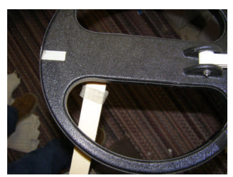
Fig. 6 Piece of Scotch 24 shield material held by a wood stick being tested.

At low delays, finding a good shield material can be a challenge as the shield can become a target and can reduce the coil's sensitivity. You can actually experiment with shield material using an existing coil. Just see if the candidate shield material is minimally detected on your PI machine when held close to the coil while operating at the lowest delay setting in the 8us to 15us range. The most accurate test occurs when the candidate shield material is moved near the coil being held by a piece of wood or plastic rather than your hand especially if your coil is not shielded.