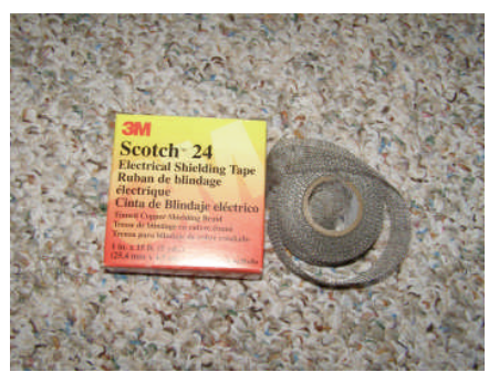
Fig. 8 Scotch 24 mesh shield

The other method is to hold the tape roll at an angle and spiral wrap around the whole coil wire bundle without overlapping the tape too much. Be sure to leave a small shield gap where the two wire leads exit the coil. Practice soldering on a piece of scrap tape first. Use a small piece of flat metal to act as a heat sink under the point where you are soldering to prevent burning a hole in the tape. Attach the wire so it is running in the same direction as the coil circumference. This can be a short piece of stranded wire or a piece of thin desoldering wick long enough to reach the coax cable. Apply a few wraps of electrical tape over the solder joint to minimize strain on the solder connection. This is one connection that you don't want to come undone after the coil housing is sealed up.