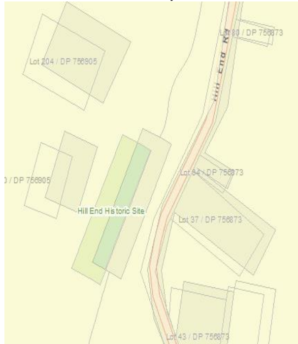
Golden Gully Arch